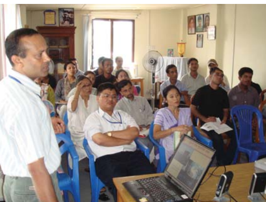
Delivering the orientation lecture

August, 2007: At the request from the Standard Chartered Bank, New Baneswor, NSET conducted an orientation program on earthquake preparedness for its staff and executive