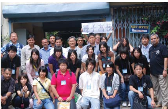
Participants from Maiko High School, Japan

The SIDE team from Kobe, Japan, organized a short training and awareness program for students of Balbikas Secondary School, Alapot, and Shree Krishna Higher Secondary School, Dhapakhel, on 24 and 27 August. Around 50 students from grade eight to ten from each school participated in the training program. The topics covered disaster mitigation and the curriculum on disaster studies, piloted by the Maiko High School of Kobe, Japan.