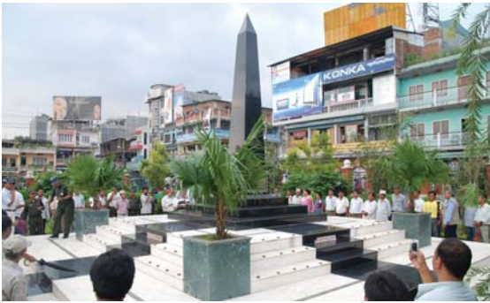
Remembering the earthquake victims : Lighting of 116 lamps at the Earthquake Memorial in Dharan