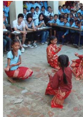
Exchanging the culture

Japan, and from Balbikas Secondary School, Alapot, also performed in a cultural program.