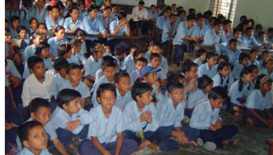
Students attending the awareness lecture

Further, training for teachers and students sensitization program on issues of Disaster Management were conducted in the five different schools of each municipality namely Kamalamai, Hetauda, Putalibazar and Vyas Municipality in the month of August and September. Under this program more than 2000 students got