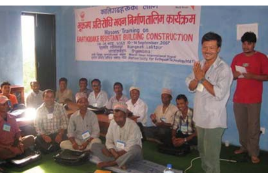
During the training