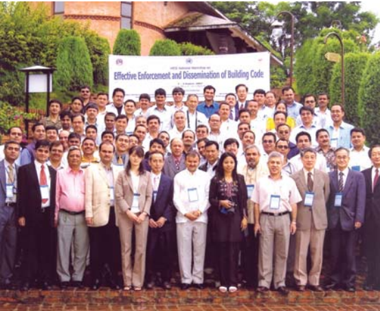
Participants of the HESI workshop

Nepal has a building code since 1994 AD but its enforcement remains weak.