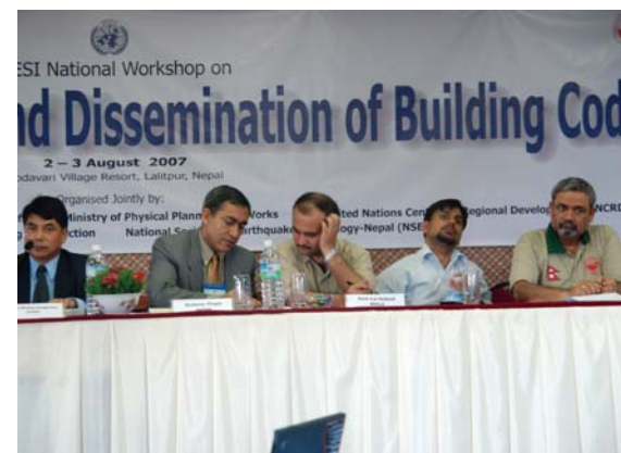
During the National Workshop

The chief executive officers and the engineers of 20 municipalities of Nepal, senior officials of MPPW, MOLD,