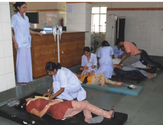
During the Hospital Disaster Preparedness Drill

response capacity of BPKIHS. The objectives were to create awareness on earthquake/disaster preparedness among hospital staff (doctors, nurses and other administrative and management staff); make concerned stakeholders aware on the role and importance of disaster drills in organizations like hospitals; and to help create a system of disaster preparedness, response planning, training, exercise and drills.