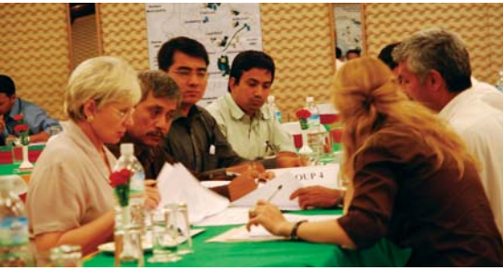
Participants involved in the group work

NSET, Lalitpur Sub-Metropolitan City (LSMC) and United Nations Children's Fund (UNICEF) organized a workshop on disaster preparedness on 30 August 2007. The "Disaster Preparedness and Response Plan Framework (DPRF) for an Emergency Due to a Major Earthquake in Lalitpur Sub-Metropolitan City" workshop was organized under the project, Disaster Preparedness Response Plan Framework (DPRP) for Safe Drinking Water in Lalitpur Sub-Metropolitan City, Nepal. The main objective of the workshop was to present and revise the draft DPRF developed previously under the Disaster Preparedness and Response Plan (DPRP) project. Project Officer of UNICEF Madhav