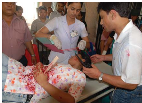
During the Drill

The drill was a “test” of the emergency response capability of BPKIHS.