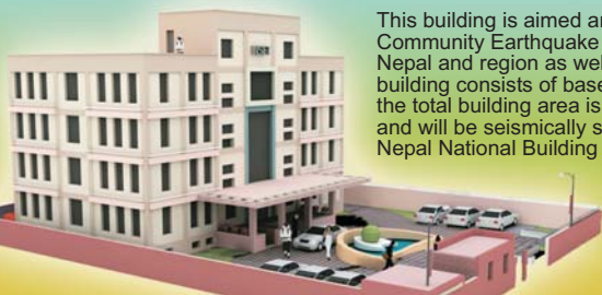
3D isometric view of NSET Building under-construction

National Society for Earthquake Technology - Nepal, (NSET) has started to construct Community Earthquake Learning Centre cum NSET office building at Bhainsepati, Lalitpur.