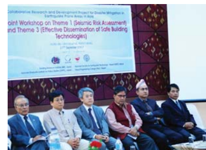
Dignitaries at the dias

The objectives of the joint-workshop were (i) To introduce the International Research and Development Project to Nepali Stakeholders, and (ii) To present the Results and Status of the R&D Project Theme1 (Seismic Risk Assessment Methodologies) and Theme 3 (Effective Dissemination of Safe Building Technology) and discussion, including the New Tool for Earthquake Risk/ Vulnerability Assessment in Cities of Developing Countries using "Google Earth" and GIS. There were 44 participants representing Ministry of Physical Planning and Works, Ministry of Local Development, Department of Urban Development and Building Construction (DUDBC), Graduate Research Institute for Policy Studies (GRIPS), Building Research Institute (BRI), Kathmandu Valley Town Development Committee (KVTDC), Japan International Cooperation Agency