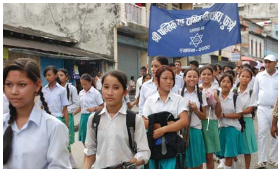
Students participating in the awareness rally

NSET and the Dharan Municipality organized various events under the Earthquake Awareness Program (EAP-Dharan 2007) from 19-24 August, 2007 to mark the 19th anniversary of August 21, 1988 earthquake. The program was supported by Action Aid Nepal.