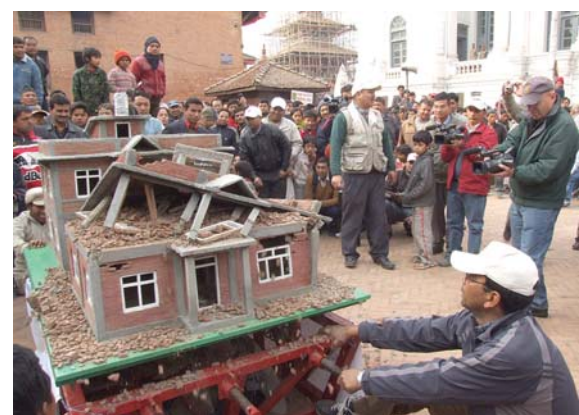
Shake Table demonstration at Kathmandu Durbar Square